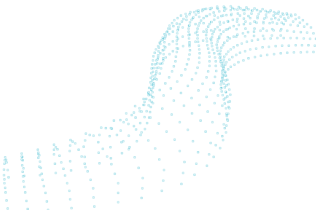
POINT DISTRIBUTION DIMENSIONED TO MAXIMIZE PRINT BED AND CURVATURE