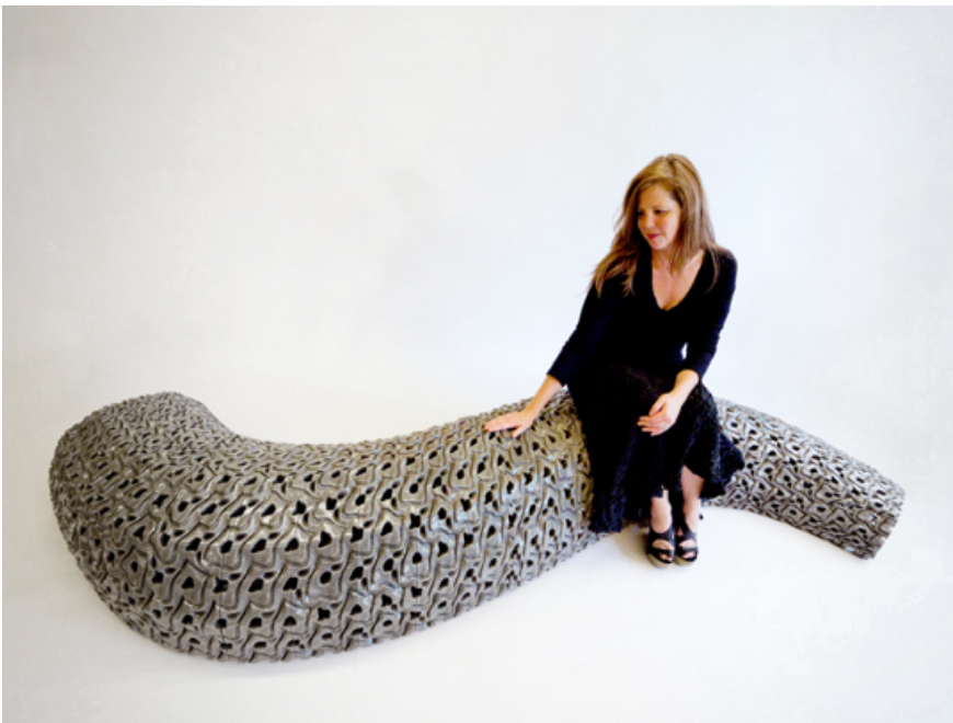
fig. 3: 11' long bench designed to support the weight of several individuals.

The small objects that we have produced thus far with the material, which include assemblies of various sizes (fig. 2 and at http://www.emergingobjects.com ) and a bench (fig. 3), which represents one of the largest-to-date pieces of furniture ever produced with a commercial powder printer, have brought much attention to the work in the form of outside interests, exhibitions and publications and potential customers. However, these objects do not realize the full potential of the research, which is to suggest that the material could be used to produce large objects, such as a house, for example.